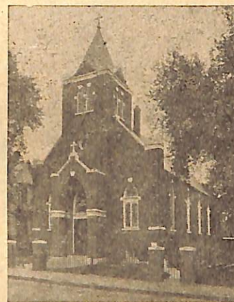
Our Savior's Lutheran Church 819 South 22nd Street